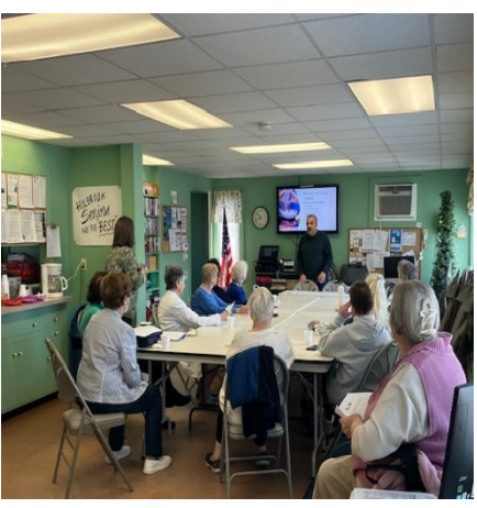
SeniorU Workshop "Healthy Eating on a Budget" (2nd Wednesday)