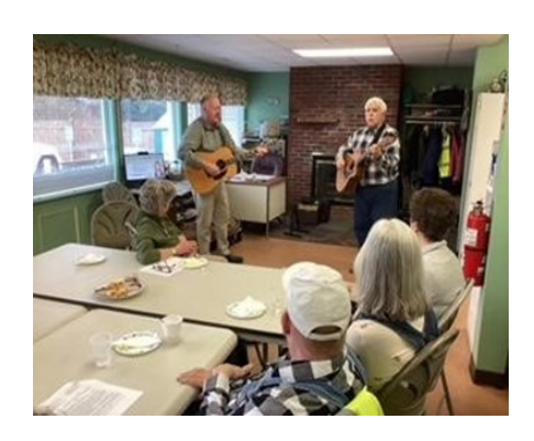
American Folk Revival (sponsored by Holbrook Cultural Council)