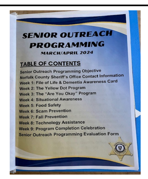
Norfolk County Sheriff Workshop Programs