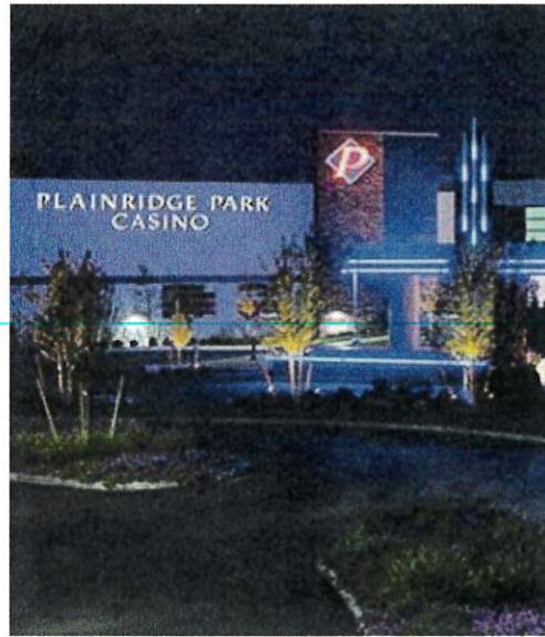
Plainridge Park Casino w/AVON