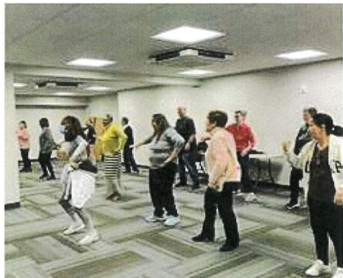
Line Dancing at Maple on Franklin

The COA is reaching out to Families with loved ones who are residing in Nursing Homes or Rehab facilities in an effort to provide "Outreach" visitation to them. Kindly contact the COA so we can discuss this in more detail (781-767-4617).