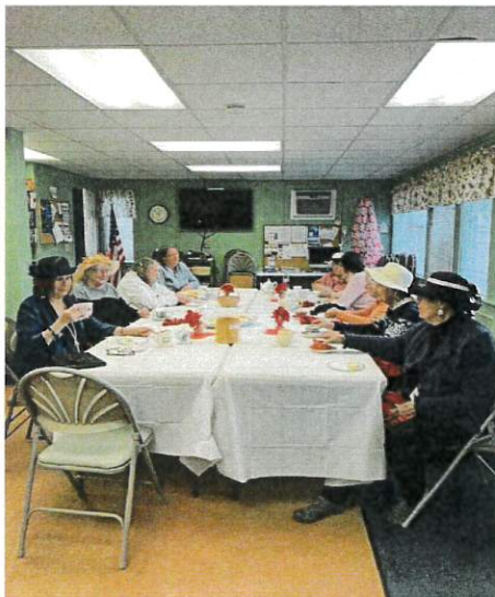
TEA PARTY at the COA