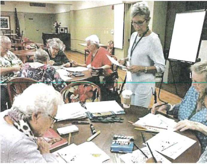
MEMORY CAFÉ — Avon COA (once a month)